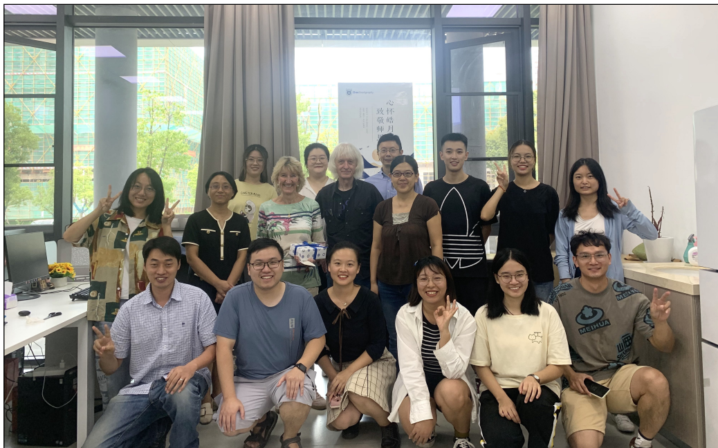
Myself with Paleo. Group colleagues and students.

My recommendation for overcoming the stereotypes associated with Chinese students. It's simple really. Accept them. Don't try to make them into simulacra of your western students. Value their difference. Learn from it (you might be surprised). Treat it as a strength to be channeled into productive pathways, not a deviation that must be discarded. Don't make them feel like outsiders because of their backgrounds, preferences or appearance. Welcome them into your intellectual community and help them make the